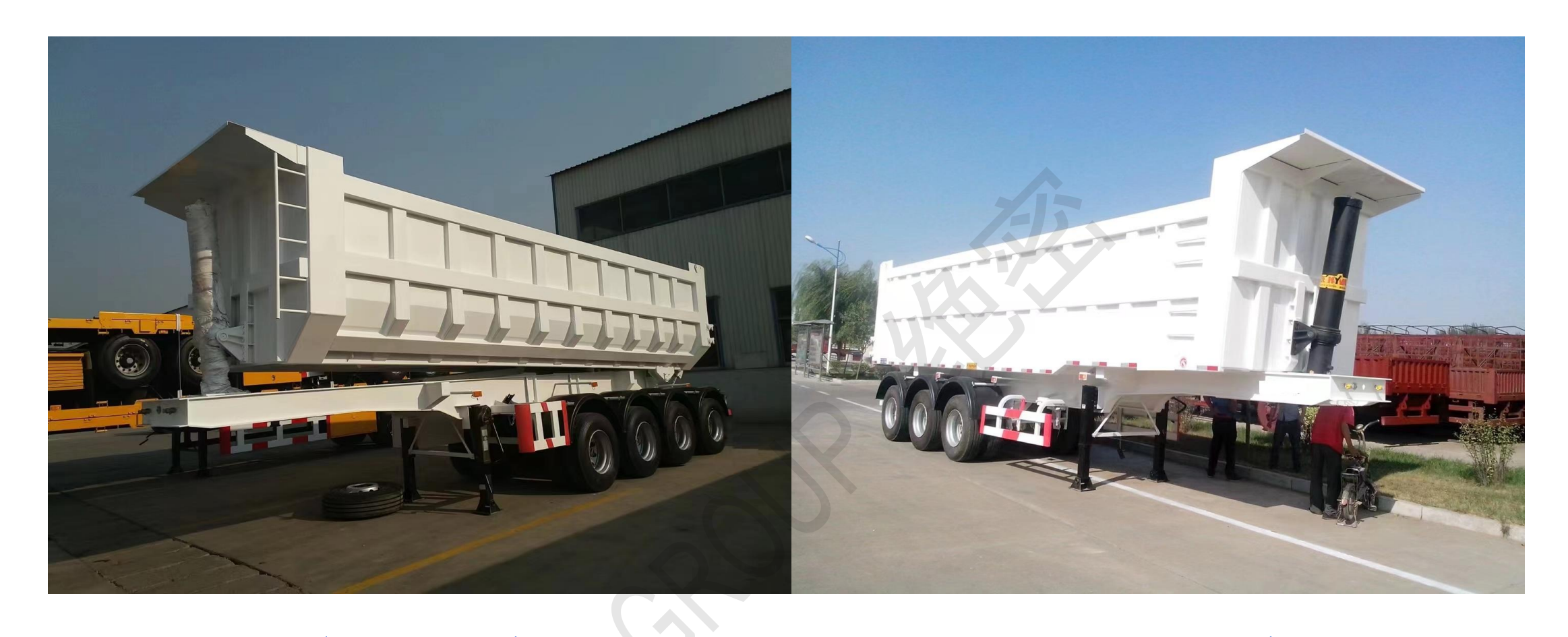
High quality Dumper Semi trailer